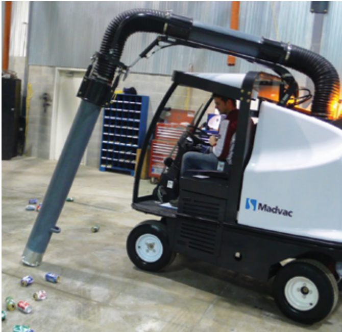
ABOVE Robotic arm controlled via a joystick