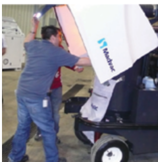
TOP LEFT 48" (1.2 m) Wide Vacuum Head