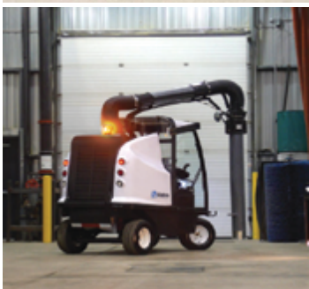
LEFT Superior rear visibility